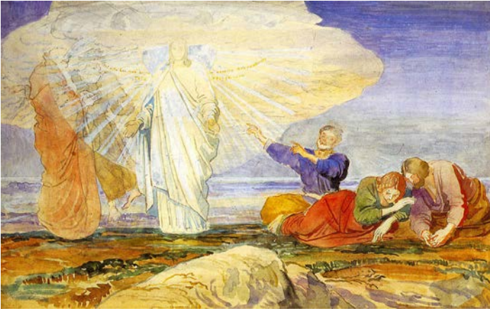
The Transfiguration by Alexander Ivanov